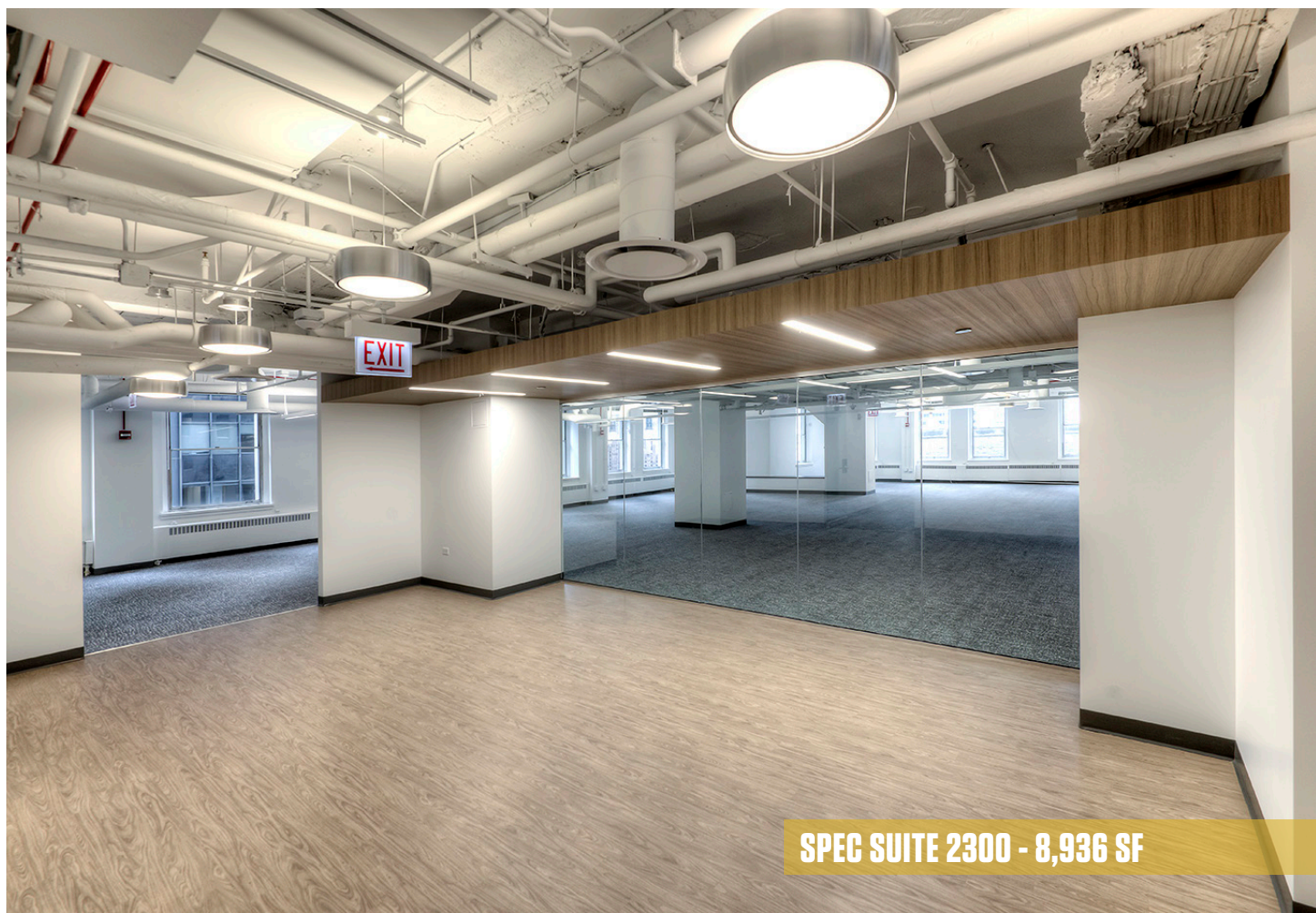
SPEC SUITE 2300 - 8,936 SF