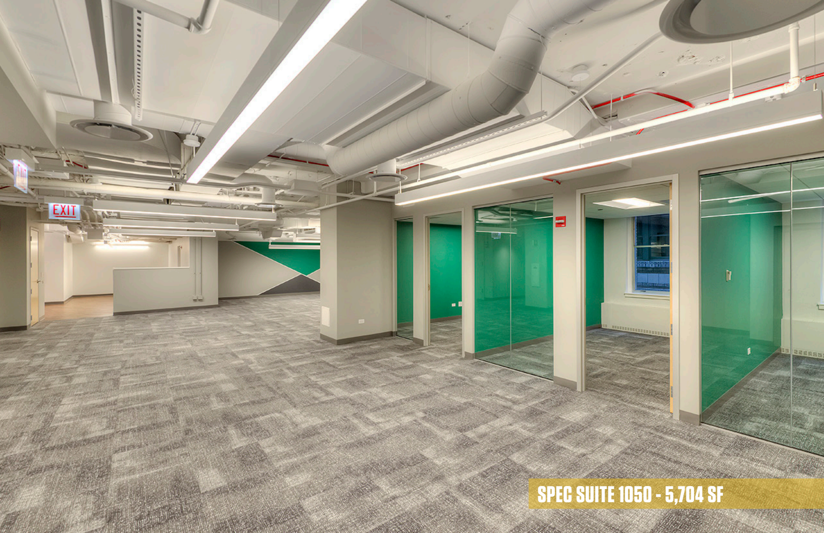
SPEC SUITE 1050 - 5,704 SF